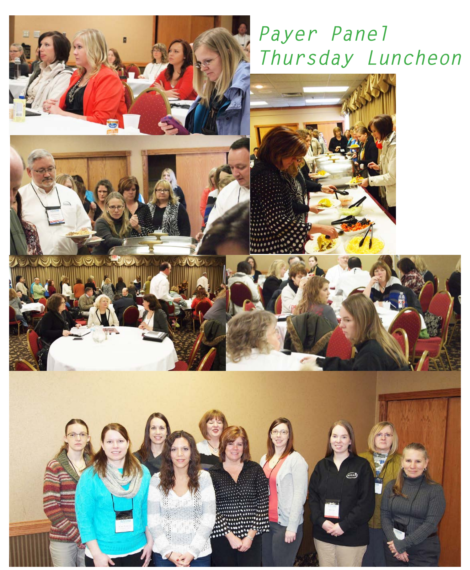
First time Payer Panel Attendees