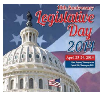
3 Leg Day Re-Cap

Certification and Chapter Excellence News