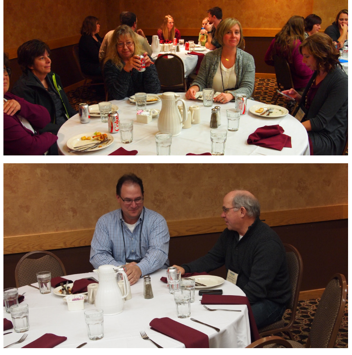
Members network during luncheon after the Charity Presentation.