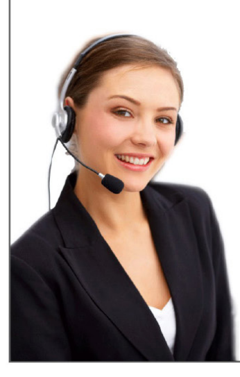
"Let us Represent the Caring Face of Your Community Hospital"

Magnet Solutions works with each client to develop specific solutions to resolve your self-pay account challenges. Our programs, which are tailored to your specific needs, create an efficient, patient-friendly system that delivers measurable results.